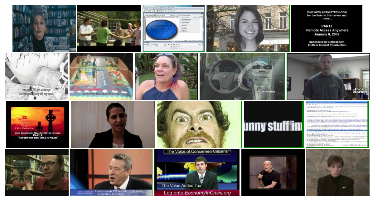
Figure 2: Frames randomly selected from MediaEval 2011 genre tagging task data. The source videos are released under Creative Commons license.