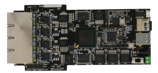
Figure 2: uG4-150 hardware platform.

EDK-based framework, firmware, application IP cores, operating system and application software libraries.